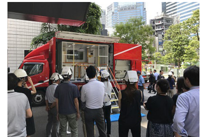
Tokyo Fire Department's earthquake simulator truck—the truck simulates the seismic intensity (7 on Japan's earthquake intensity scale) of the March 2011 earthquake

We have developed a business continuity plan, which we continually review and revise as part of a business continuity planning lifecycle. The plan includes measures for maintaining a stable supply of goods when an emergency disrupts operations in our plants or offices. Mindful of how severely businesses can be affected by the increasingly prevalent catastrophic events such as earthquakes, extreme storms, flooding, fires, and infectious disease, we have reaffirmed the importance of getting the initial responses right and minimizing the damage from such calamities. Our plan outlines what initial responses to take, and how to follow them up, in different kinds of disaster/emergency scenarios (including a state of emergency). Through such planning, we aim to go further in ensuring that every employee will act swiftly and safely in an emergency to safeguard human life.